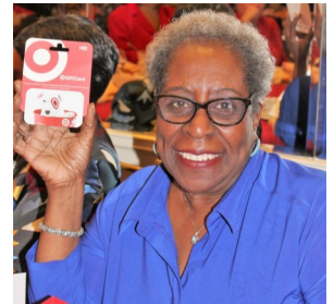
Lucky winners of beautiful gift baskets, the raffle gift cards, money plant and the lottery photo went away carrying their prizes and huge smiles.