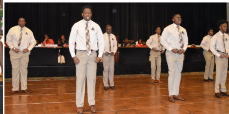
Kudos Preparing to place First in step