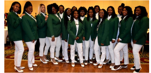
Ready for the day's activities