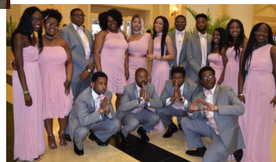
Dressed for Saturday Evening Awards' Banquet