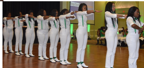
Xinos stepping out strong