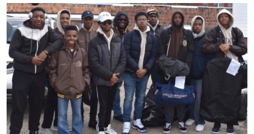
Happy travelers stopped to smile for the camera as they prepared for their trip