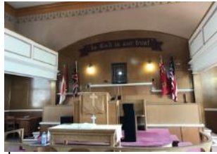
St Catherine's British Methodist Episcopal Church