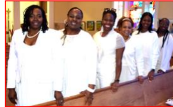
Beta Epsilon Chapter