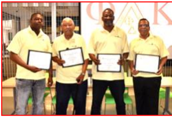
Alpha Chapter Anthropos receive Certificates of Appreciation. They awarded scholarships to five Kudos