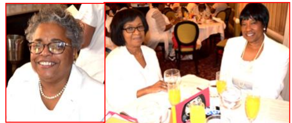
Trivia from 1923 Housing and Furniture