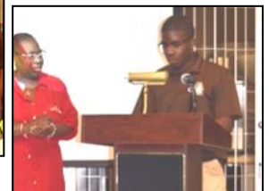
A warm thank you from the Kudos