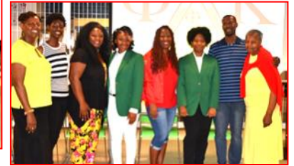
Scholarship winners with parents and scholarship chair