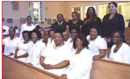
Delta Nu Chapter with their Krinon Club