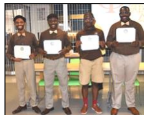
Certificates and scholarships from the Anthropos