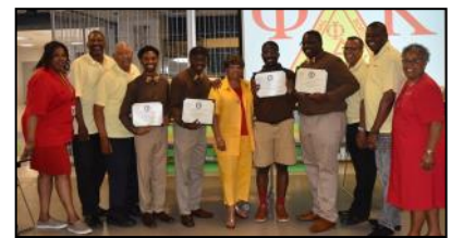
Anthropos, with Chair, Co-chair, and Basileus congratulate Kudos