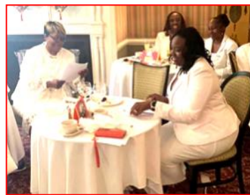
Interview with Founder Hunt—Skit