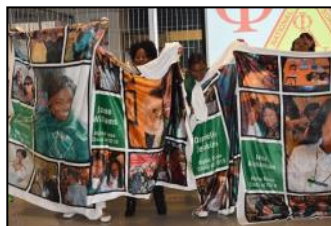
A Gift to remember and cherish was given to each Xinos by their advisors