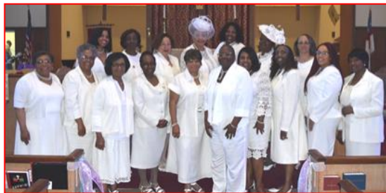
Sorors of Alpha Chapter