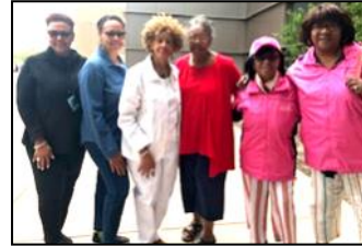
Three sets of biological Sisters joined the sorority sisters of Alpha Chapter