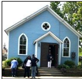
R. Nathaniel Dett Memorial Chapel, British Methodist Episcopal Church