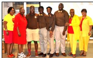
Advisors, ER Kudos Chair and Basileus congratulate Kudos