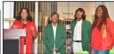
Advisors' Presentations to Xinos