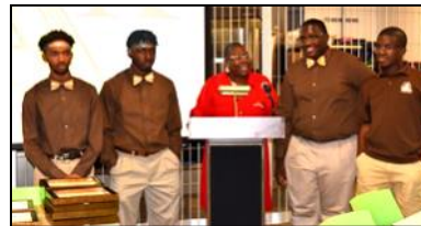
Advisors' Presentations to Kudos included items for their dorm room