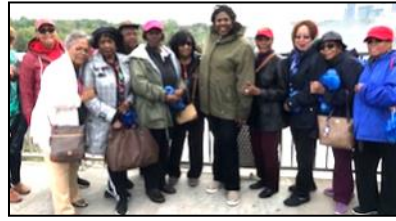
Alpha Sorors enjoying the activities