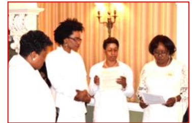
Trivia from 1923 - History, Food, Clothing