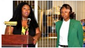
A Xinos' parent extends sincere gratitude to the sorority for assistance in rearing her daughter and for the book and art scholarships she was awarded.