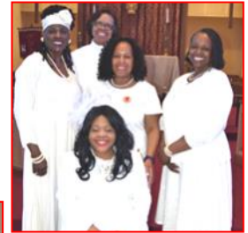
Epsilon Chi Chapter