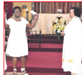
Presentations to Church were made by all chapters