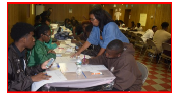
Youth work on group activity

along with Soror Baskerville, and provided useful information to the group. All youth were actively engaged and worked well with each other for a successful and productive afternoon.