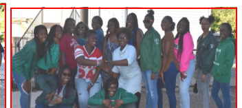
Youth enjoy Back to School BBQ