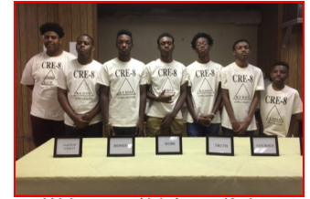
Welcome to Alpha's new Kudos