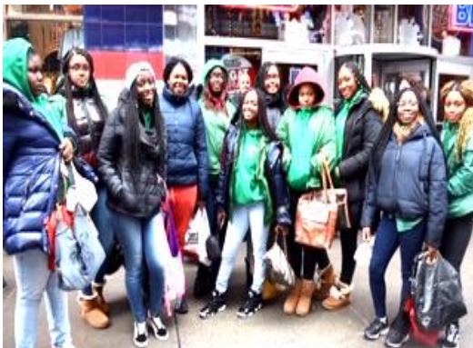
Youth with Advisors and Hub parents are ready to make some homeless people very happy .