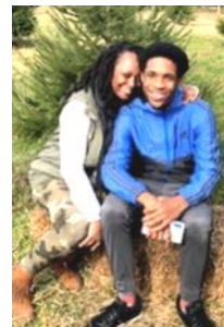
Hub Parent mom with Kudos President enjoying the outing