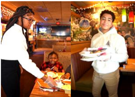
Youth took their jobs seriously and as always, provided service with pleasant attitudes.