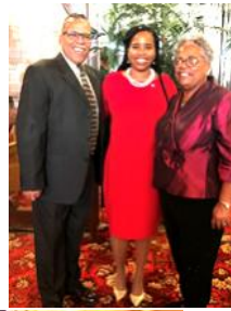
Best friends for a long time