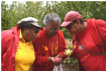
Inspection time. Look at this one!