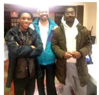
Kudos commended by the President of Jersey City Board of Education.