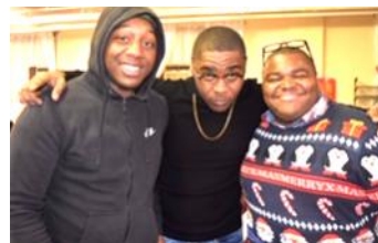
Former Kudos in attendance to share in the festivities