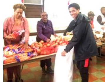
Kudos packing food items to deliver to neighborhood residents