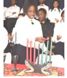
Youth light a candle for each principle of Kwanzaa.