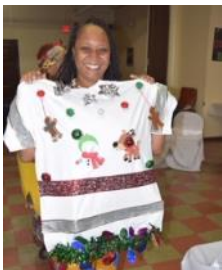
Ugly T-shirt looks great!