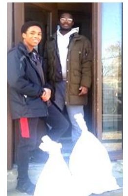
Kudos delivered bags of food to people in the church community.