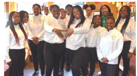
Alpha Chapter's youth are thankful for the support.