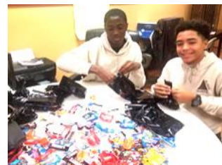
Preparing the goody bags!