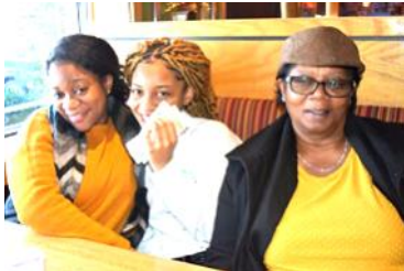
"Here's My money."