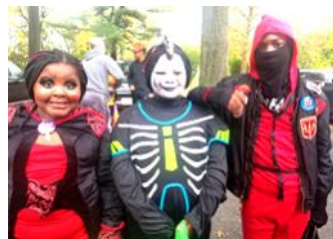
Ready— Set— 'Trunk-or Trreereaat'!