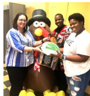
The basket for Newark was Delivered by former youth group members.