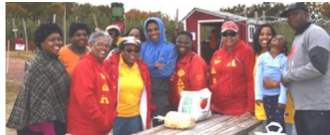
Sorority sisters, Anthropos Kudos Hub Parent and friends