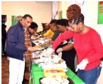
Lots of delicious food was provided