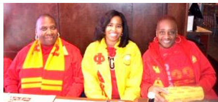
Alpha youth Advisors met Epsilon Alpha youth and Advisors (below) for lunch.