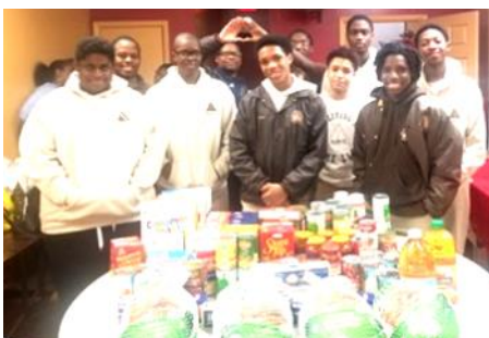
Kudos show prepared Thanksgiving Baskets.