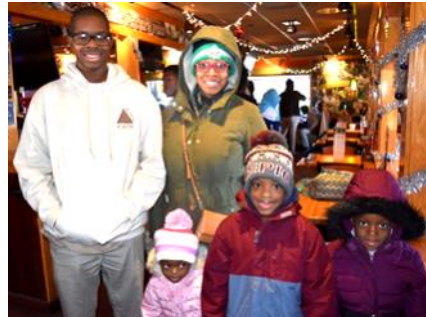
Family time is Fun time for everyone.