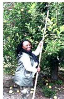
She's got one!