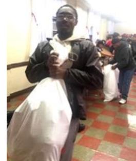
This bag is ready to go.