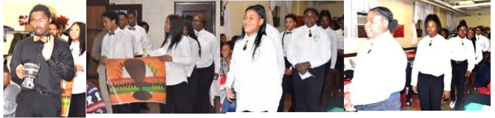
Youth enter the auditorium ready for their presentation.

Later, everyone shared in an abundance of food, drinks and desserts. The people had a wonderful evening and are looking forward to the 2020 celebration.