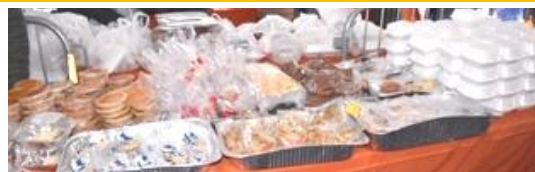
An abundance of food with service being provided with politeness and smiles