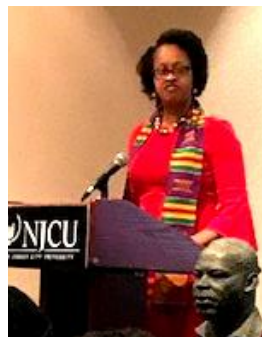
Assemblywoman gives her points of view on the theme.