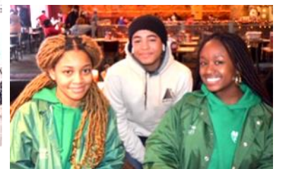
Youth enjoying lunch at Dallas BBQ