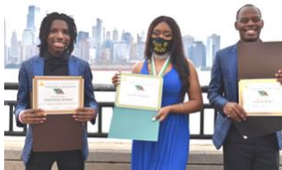
4-year Members of Xinos and Kudos