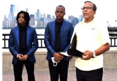
Anthros Presentation to Kudos