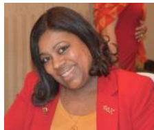
Alpha Chapter Soror is representing Alpha Chapter and the Eastern Region on the NSPDK eLearning Academy National Committee

Delta Kappa, Chapter, Inglewood, CA; Far West Region,