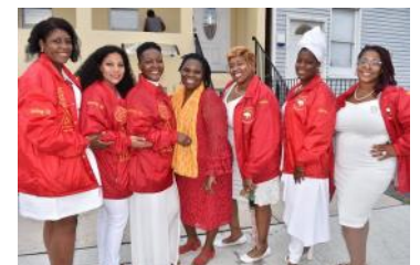
Each new soror was given a personalized red jackets