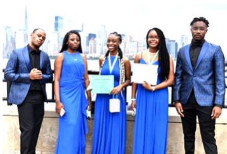
2020 Award Recipients