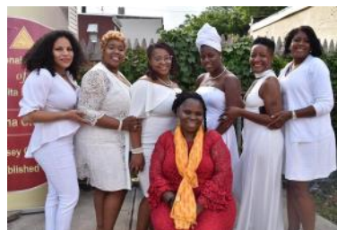
The 6 Virtue-al Queens pose with their wonderful Dean of Pledges