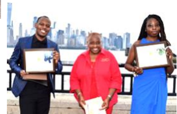
Xinos of the Year / Kudos of the Year