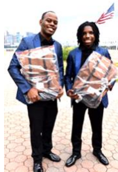
Gifts for Senior Kudos