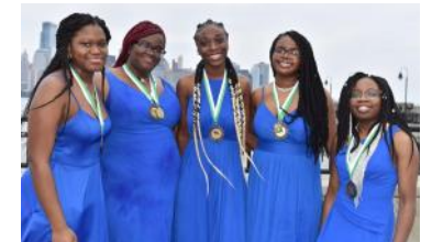
Gift for activity book queens