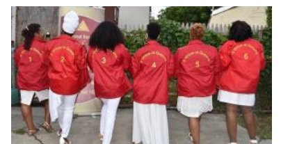
New sorors loving their jackets