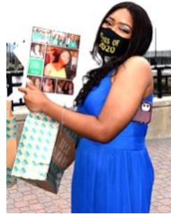
Gifts for Senior Xinos