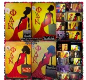
3 Krinon took part in Gamma's Paint Party