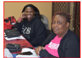
Hub Parents smile as they wait for the drawing to take place.