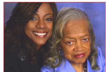
Actress Bern Nadette Stanis cared for Her Mother who had Alzheimer's

Do not go it alone. Trying to handle the responsibilities of caring for a loved-one alone can lead to burnout and stress-related health problems. It is important to reach out to family, friends and community resources that can form a network of support. Remember to consider the loved-one as part of the team.